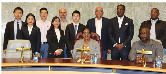
The Office of the Prime Minister received a combined donation of N$ 6 655 000.00 from Meat Board and Contractors under the Roads Authority of Namibia towards drought relief on 19 September 2019. Of this amount, Meat Board donated N$ 6 million and the Contractors donated a collective amount of N$ 655 000.00.

The Prime Minister noted with appreciation positive response through donations by individual Namibians, business people, foreign governments, national and international organisations. She further urged individual Namibians to support drought relief efforts adding that “if Namibia as a country survives the drought situation, individual Namibians will also survive.”