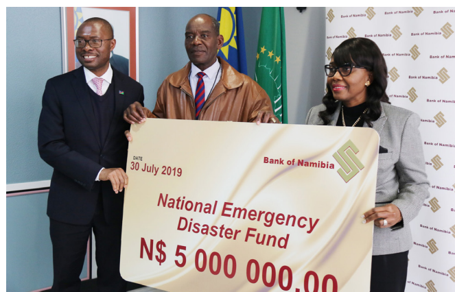
Prime Minister Dr. Saara Kuugongelwa-Amadhila gladly received a donation of N$ 5 million from the Bank of Namibia (BoN) towards drought relief. BoN's Governor, Mr. Ipumbu Shiimi handed over the donation. The money will be deposited in the National Emergency Disaster Fund.

The government require the support of all Namibians to continue the programme in order to save lives instead of spreading detrimental rumours, which are counterproductive to the national drought mitigation efforts.