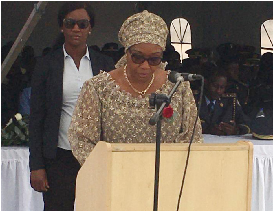
Hon. Prime Minister Dr. Saara Kuugongelwa-Amadhila

The completion of this facility is part of Government's efforts to decentralize functions related to law enforcement and ensure a conducive environment for the Namibian Police to serve communities efficiently and effectively.