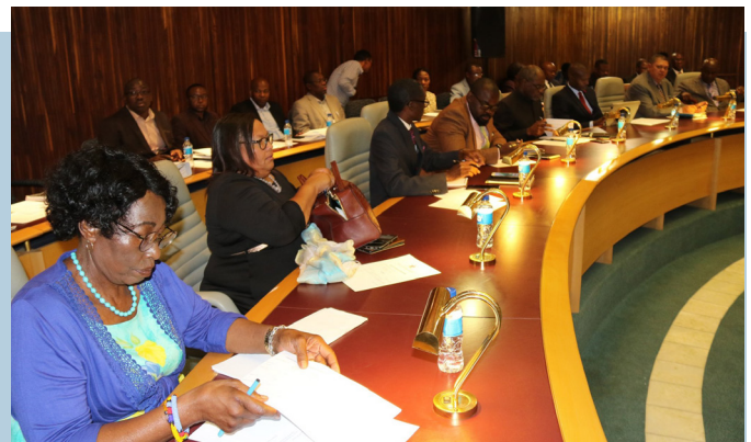
Prime Minister Dr. Saara Kuugongelwa-Amadhila engaged with Governors, Executive Directors, Chief Regional Officers and Chairpersons of Regional Councils on the implementation of the drought relief program, the success and challenges to ensure effective management and implementation of the drought intervention program. The event took place on 02 October 2019.

“The same goes for the rations to be provided to households. Where circumstances dictate, the size of the food ration